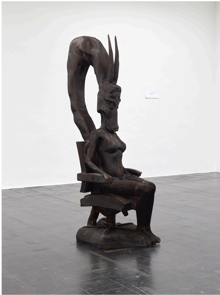
Sidsel Meineche Hansen, ONE-self (2015). Courtesy the artist and Rodeo London/Piraeus. Photo: Simon Vogel

Currently on display at Rodeo in Piraeus, the burned wooden sculpture ONE-self (2015) depicts a totemic figure that is part pornographic priestess and part snake-headed god. We are all chimeras, it suggests, our conflicted selves constructed by spectacle and pharmacology (the snake nods to the serpent twined around Asclepius's rod). Meineche Hansen's deeply ambivalent work suggests that if the insurrection is coming it will take the form of a civil war: less a pitched battle between two teams of sovereign individuals fighting on the streets under the banners of Us and Them, more a long conflict within the self to regain control of our own bodies and minds.