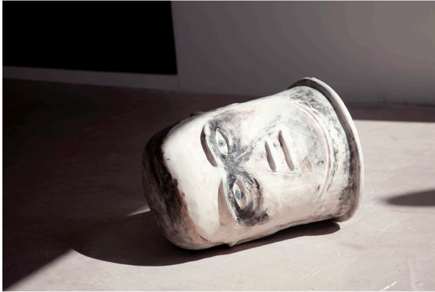
HIS HEAD, 2014, clay and black epoxy, dimensions variable.