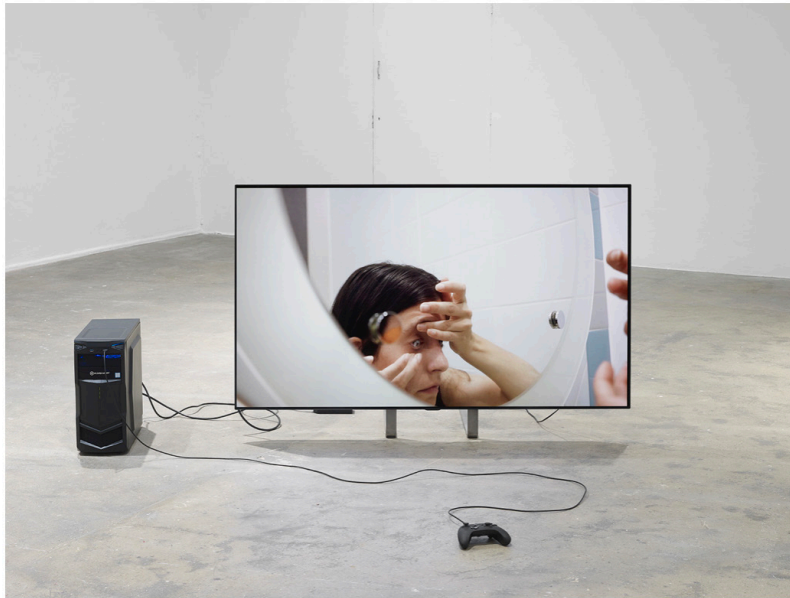
Welcome to End-Used City , 2019 (installation view, Chisenhale Gallery, London, 2019).

While her labour is made visible by the film, the face of the ‘maintenancer’ is never shown, her name not given. This expresses another of the tensions that animate Meineche Hansen’s work: when so much capitalist exploitation is predicated on hiding the labour that underpins its production, there is a moral imperative to draw attention to those workers; yet to profit from the publication of an individual’s identity is to exploit them. Particularly in a surveillance society.