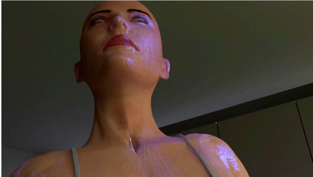
Seroquel ® (still), 2014, HD video and CGI animation with sound, on flatscreen, 8 min. Courtesy the artist and Rodeo, London & Piraeus

These preoccupations are introduced in the CGI animation Seroquel ® (2014), first exhibited at London's Cubitt Gallery. The eight-minute work is named after an antipsychotic drug that became notorious after its manufacturer – the now household-name AstraZeneca – was fined half a billion dollars for paying kickbacks to doctors who prescribed it to patients (including children, the elderly and prisoners) to alleviate conditions for which it had not only not been approved but that were as diffuse as aggression, anger management, anxiety, depression, mood disorder and sleeplessness. Promotional material for a pharmaceutical company showing the passage of its product through the body is spliced with scenes in which a female avatar experiences what is either a catastrophic breakdown (paradoxically, the listed side-effects of Seroquel include psychotic symptoms) or a liberating transformation. In the context of work that foregrounds body hacking and physical metamorphosis as a means of escape, it might conceivably be both.