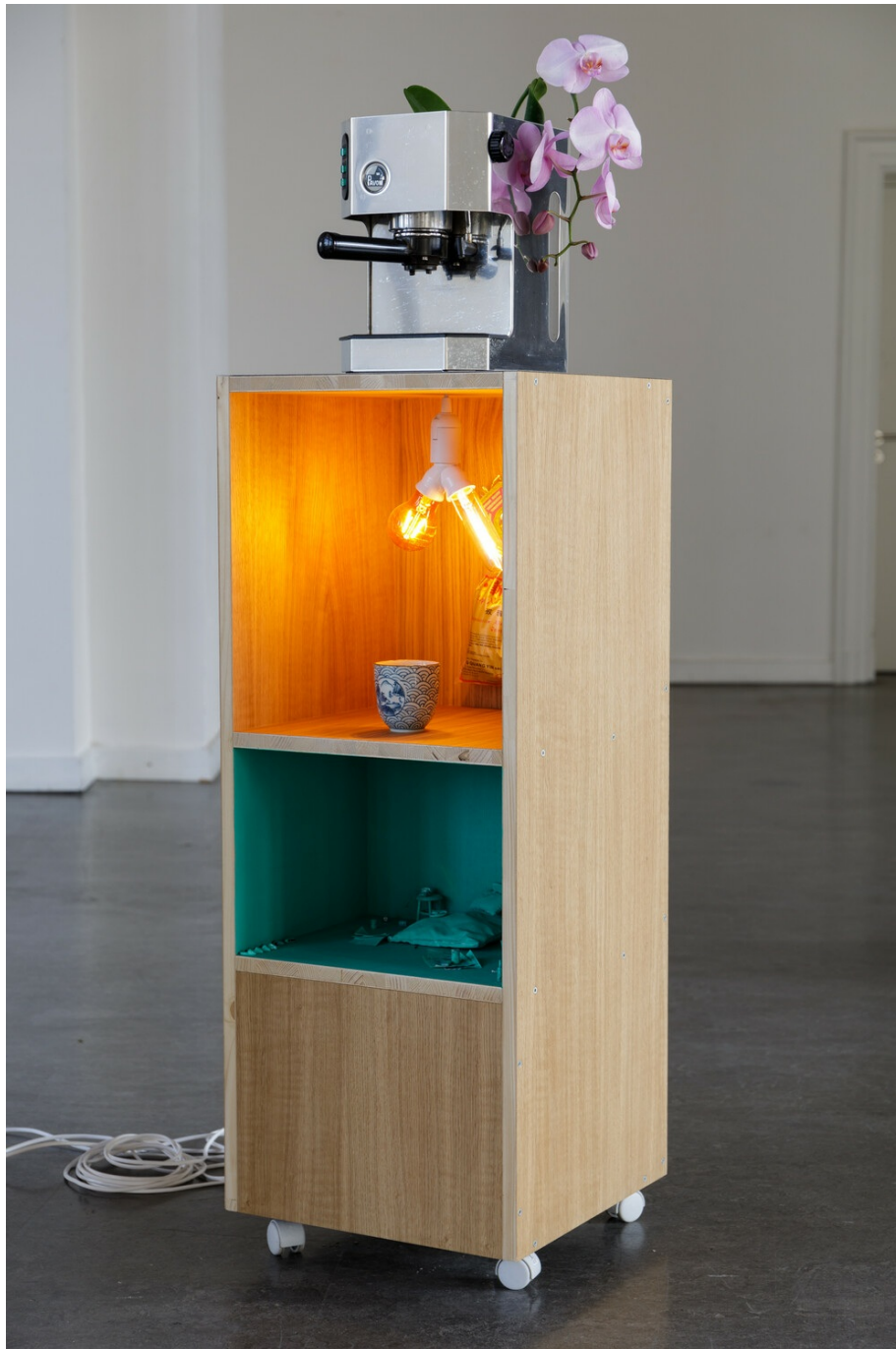
Fig. 3 Volkswagen (Ashley) , by Phung-Tien Phan. 2020. Oak, miniature furniture, acrylic paint, lamp, altar, espresso machine and flowers, 40 by 40 by 110 cm.

I've noticed one thing lately. Man, people love vintage stuff. Like those Jean Prouvé chairs? Ugh, dying for it. Or those Charlotte Perriand dining tables? Uh-mazing! Are those like, uh, when Vietnamese cuisine was enhanced through French colonial leadership? Are those Hermès Margiela era? Completely iconic.