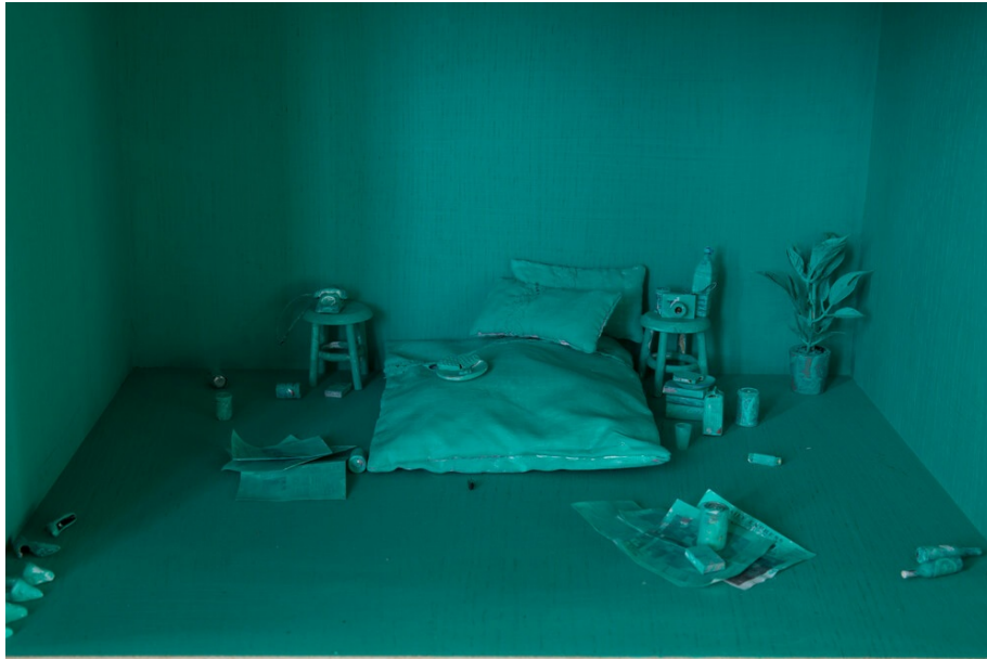
Fig. 4 Detail of FIG.3.