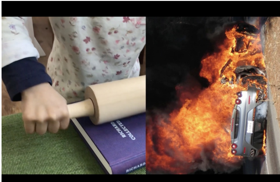
Fig. 6 Still from girl at heart , by Phung-Tien Phan. 2020. Video, duration 5 minutes 9 seconds.

failed one, an ideal that no one can embody. In this sense laughter emerges in the realization that all along the original was derived. 4