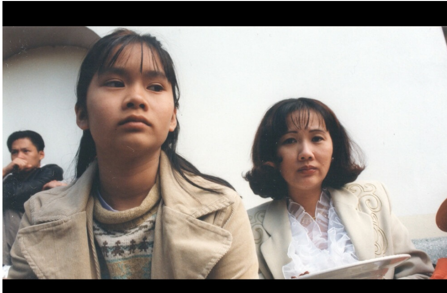
Fig. 12 Still from Toni 3 , by Phung-Tien Phan. 2023. Video, duration 2 minutes 37 seconds.